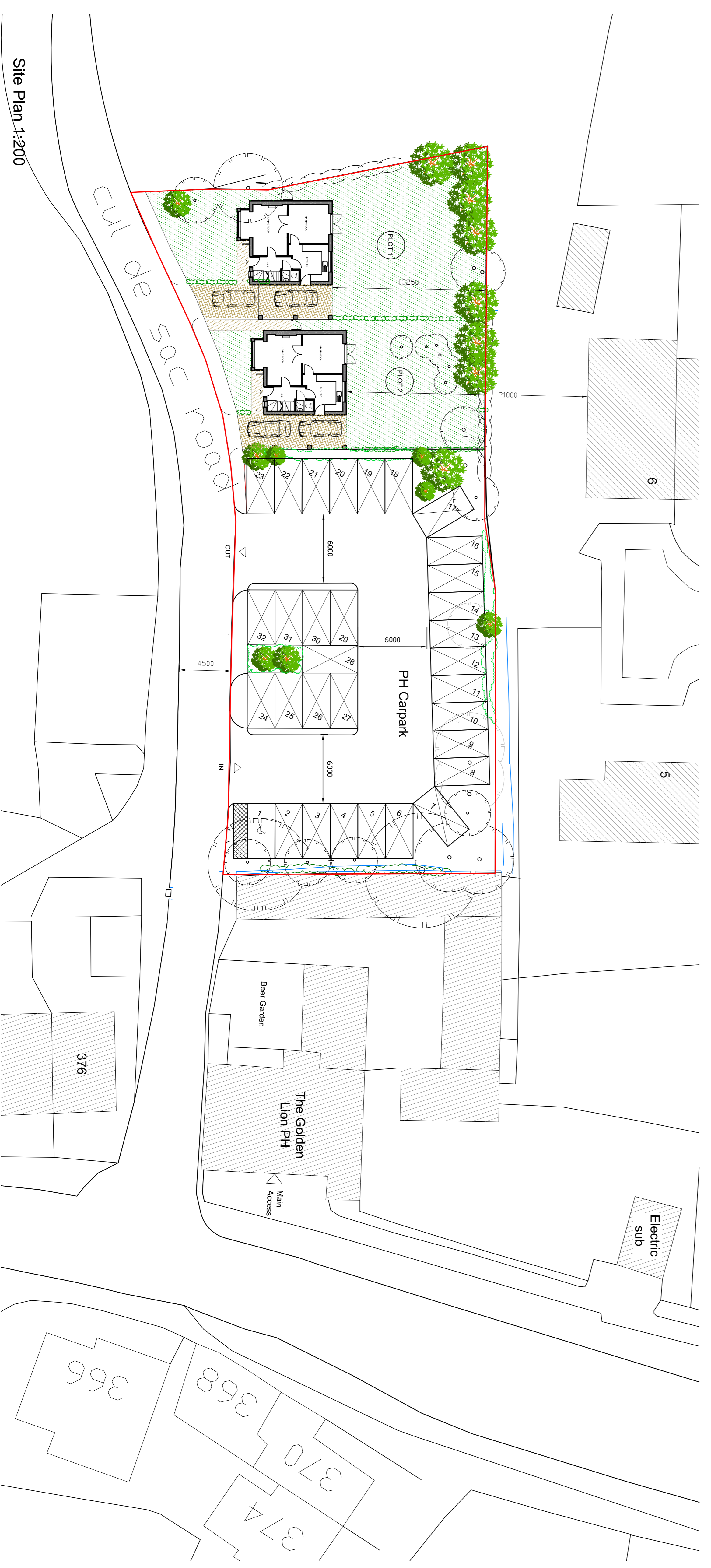
Site Plan 1:200