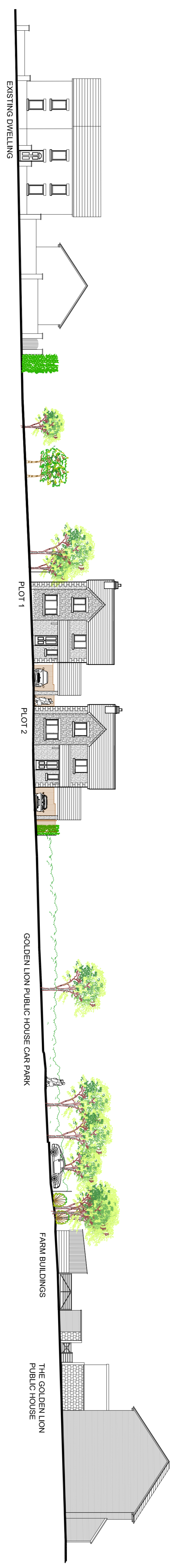
Proposed Elevation from Street 1:200